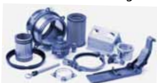
Special and General Aviation Products