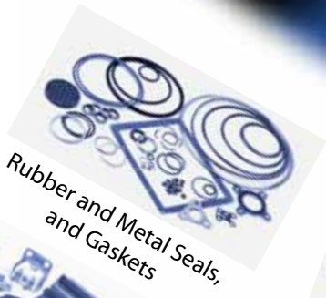
Rubber and Metal Seals, and Gaskets