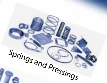
Springs and Pressings