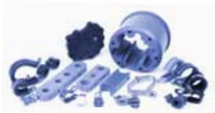
Clamps, Blocks and Special Mouldings

Effective focused supplier management and rationalisation from one of the world's most experienced procurers of aerospace and defence product