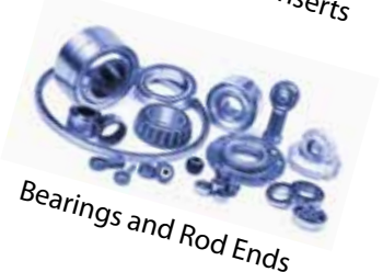
Bearings and Rod Ends