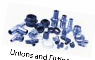
Unions and Fittings