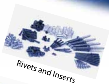
Rivets and Inserts