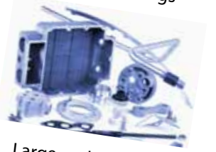
Large and Complex Components